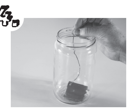
Place the copper plate on the bottom of the glass jar and drape the wire over the lip of the jar.