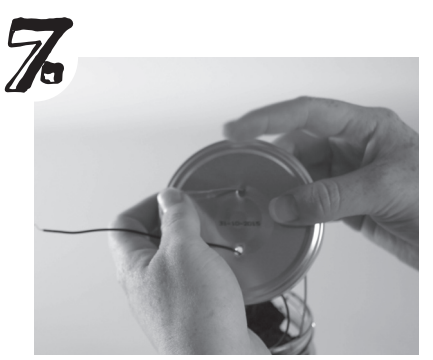
Make two holes in the jar lid, pull the wires through, and gently close the jar. Now connect the voltmeter cables to these two wires.