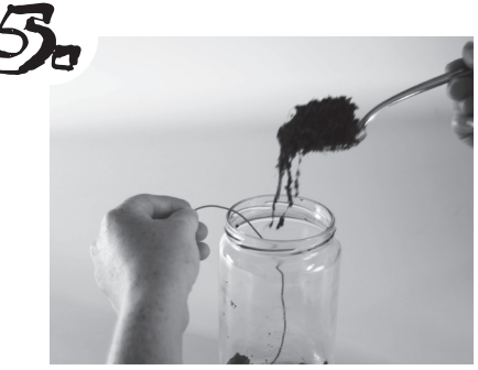
Carefully fill the jar with dirt until it is almost full.