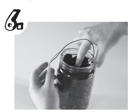
Now insert the screws into the soil and cover them with a final scoop of dirt.

Solder the end of the red wire to the piece of copper.